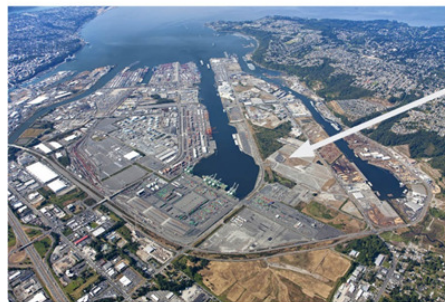
Graphics thanks to NWW and CHB